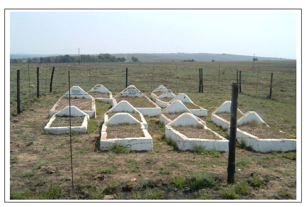
Figures 3 & 4- GY01 and GY02 in the eastern parts of the Eskom Project Area (above and below).